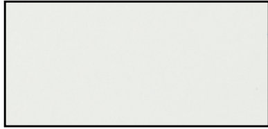
WHITE (US ONLY)